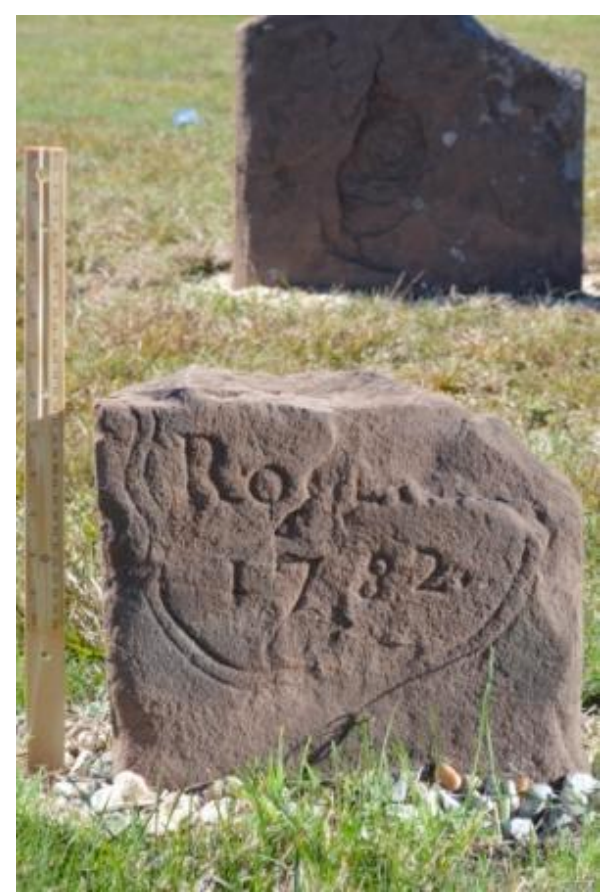
Condition in 2006