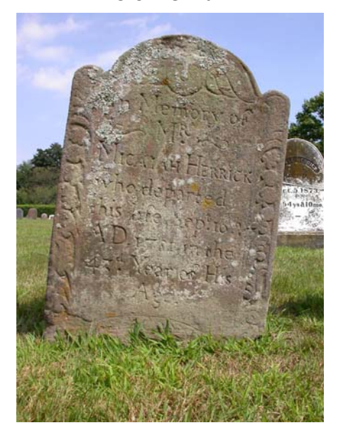
Condition in 2006 U of Penna