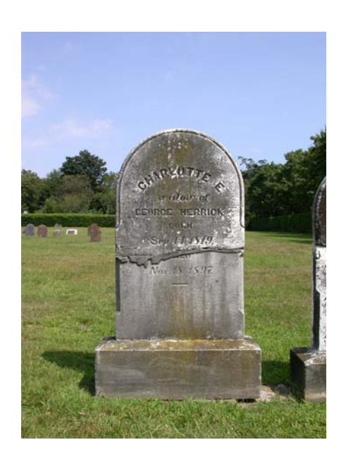
Condition in 2006 U of Penna

9/27/2015: DECORATIVE MORTAR ADDED TO BREAK LINES.