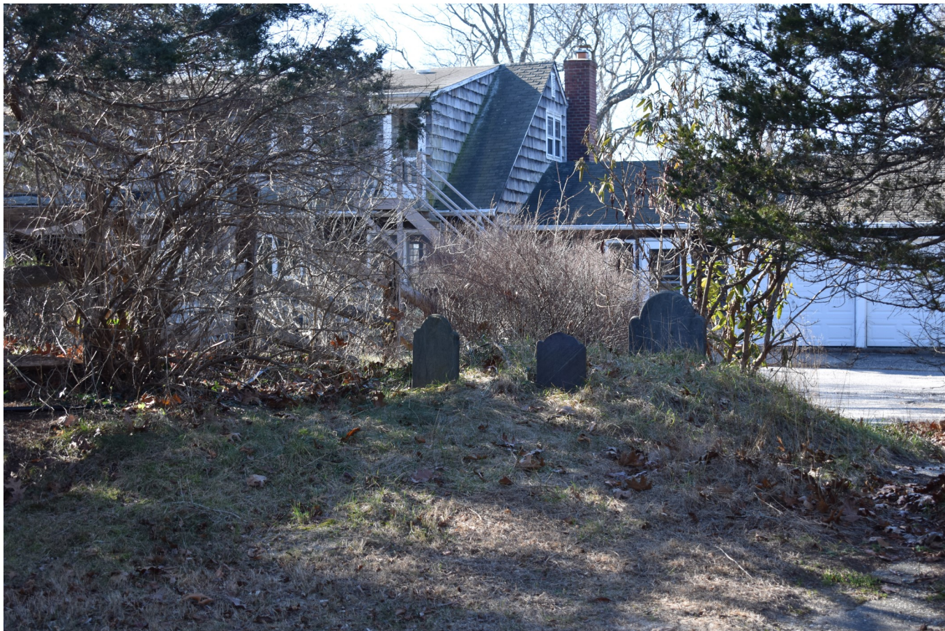
Facing west of all three stones. Photograph December 2018.