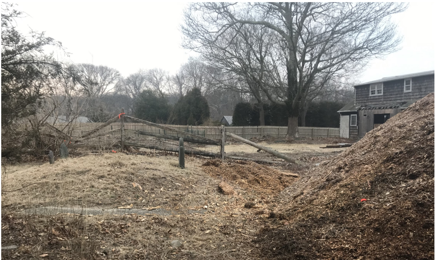
After excavation property, top with house, and below close up of headstones, looking south.