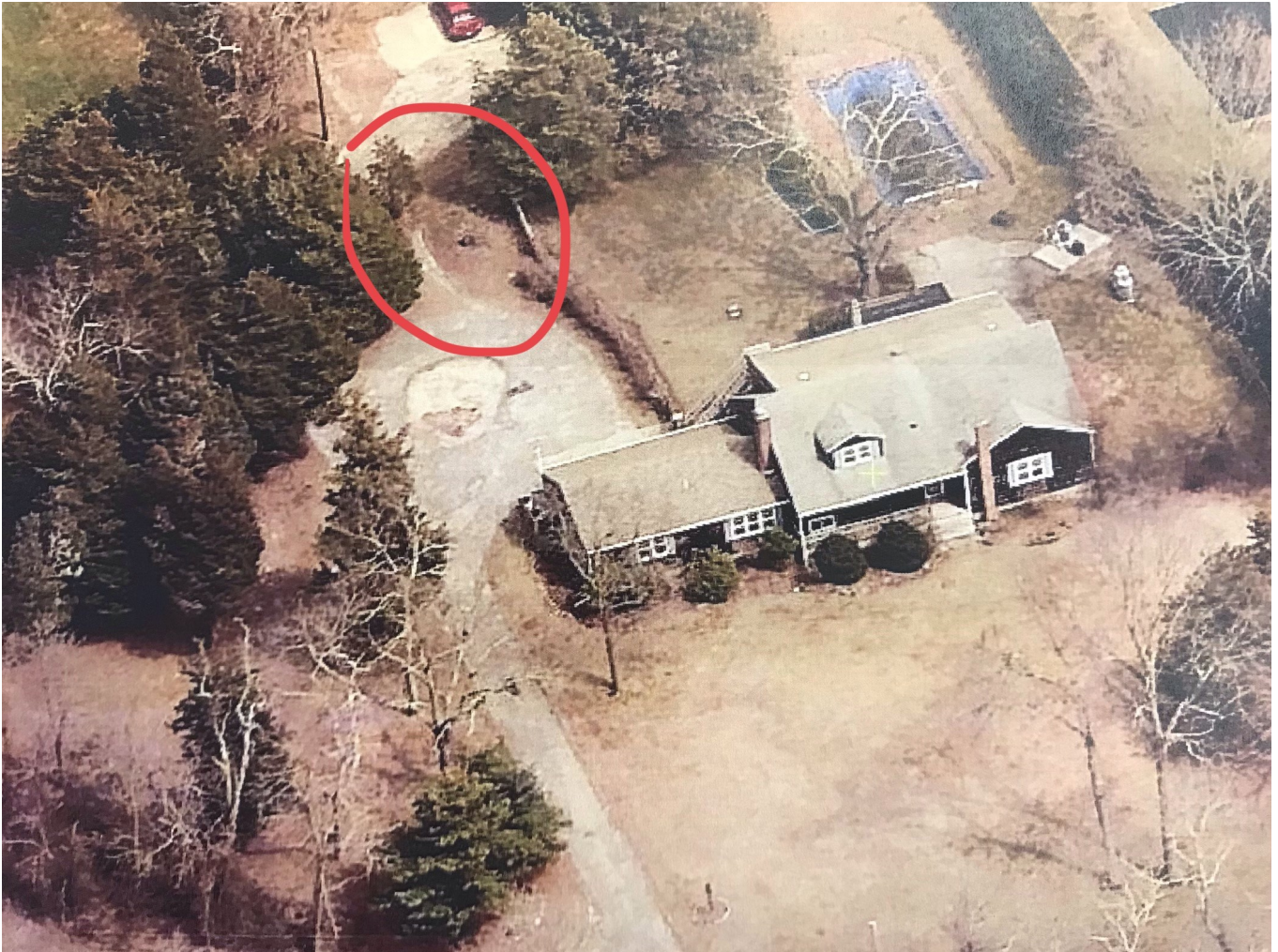
2014 Aerial photograph of 130 Scott Rd, North Sea with Old Rose Family Cemetery, circled in red, 2 headstones & 1 footstone.