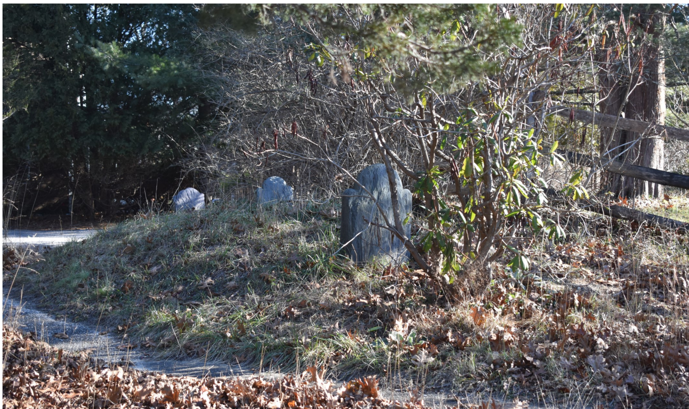
Facing east of all three stones. Photograph December 2018.